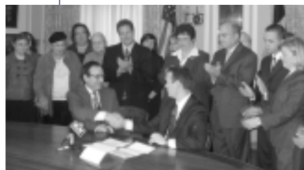
City Council President Doug Shields and Mayor Luke Ravenstahl sign the ordinance into law surrounded by various women's groups and community organizations.